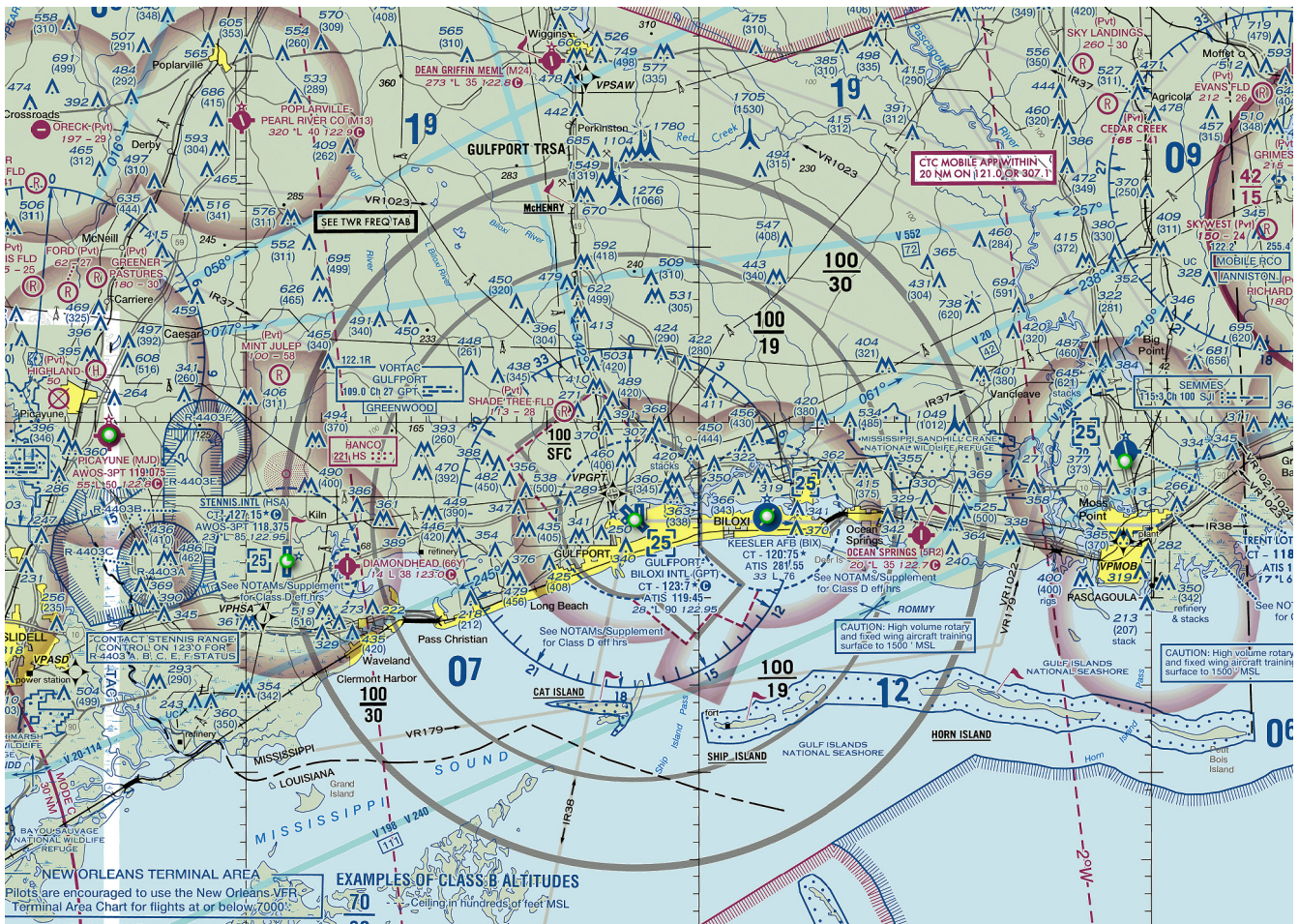
Chart depiction: solid black line, altitudes for each segment. Depicted on VFR sectional charts and terminal area charts. Class D portion depicted with blue segmented line.